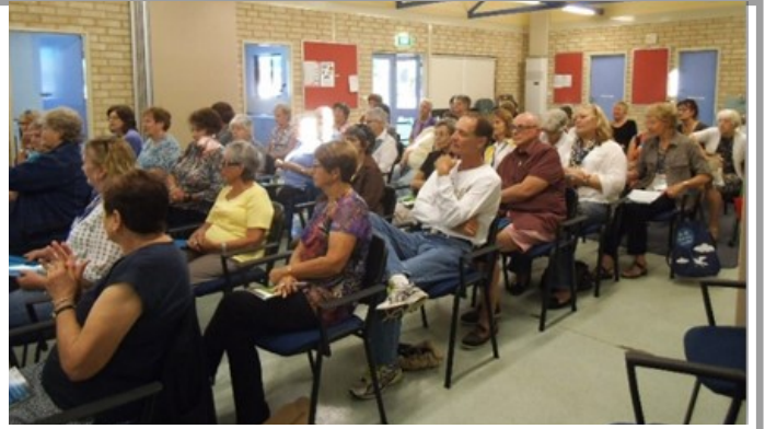
Photograph of our last Refresher Session held at Hudson Road Community Centre Withers—It was packed!!

Phone Jan on 0499 240 371— by 23 March at latest.